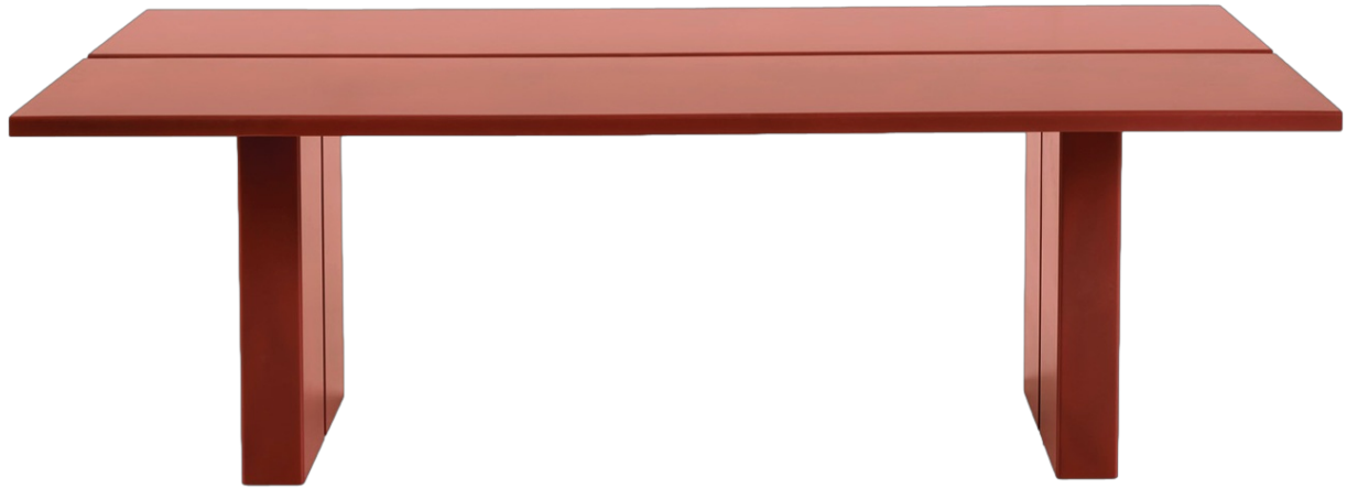
EIDOS / TABLE, Gabriele & Oscar Buratti

The rectangular tables combine geometric elements with different thicknesses, covered with a semi-gloss resin in bright colours with a cloudy effect. GFRC concrete bases, marine plywood top, semi-gloss resin finish.